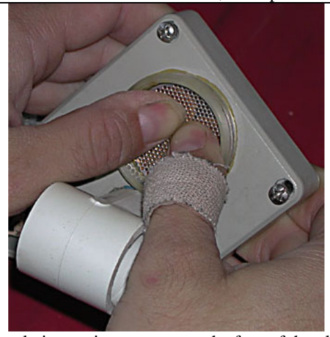
2. Apply increasing pressure to the face of the old transducer with your thumbs until it pops free. Remove any remaining silicone rubber from the sensor case.