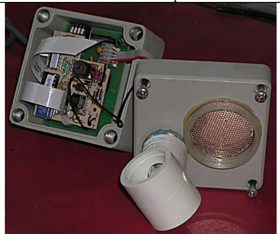
1. Open sensor by loosen the 4 captive screws. Carefully remove the old desiccant pack and replace it with the new one provided. Tuck the new pack in as far as possible so that it is out of the way.

Materials needed: Replacement Transducer, Small tube of clear Silicone Seal, Forceps