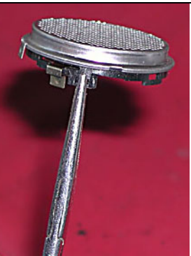
4. Gently lock the forceps onto the plastic tab of the new transducer shown above.