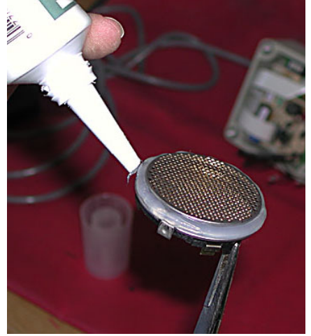
5. Apply a bead of silicone seal to the rim of the new transducer. Avoid getting silicone seal on the grill or terminals. Mount the transducer into the case. Seat the transducer by pressing on the plastic rim only, do not push on the center.